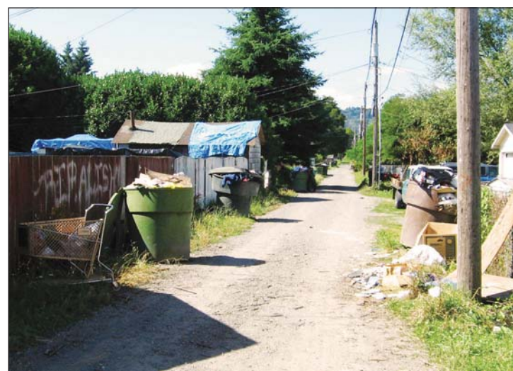
A typical alley BEFORE Carts-for-Tubs