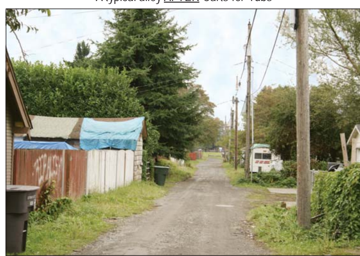
A typical alley AFTER Carts-for-Tubs